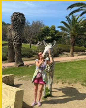
I love zebras: this is in the Parque de la Paloma in Benalmádena